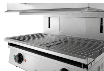
▶ Cooking grid size ✓ W 590 x D 320 mm