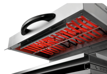
▶ Salamander with 2 heating zones