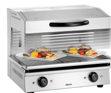
▶ With practical lift function ✓ Clear height: 65 - 210 mm